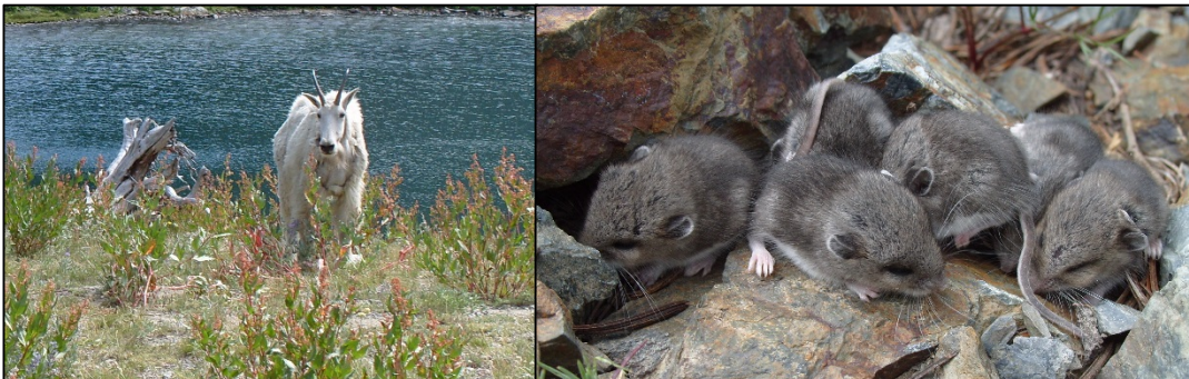
Figure 2. Fauna, large and small, of the Elkhorn Mountains.