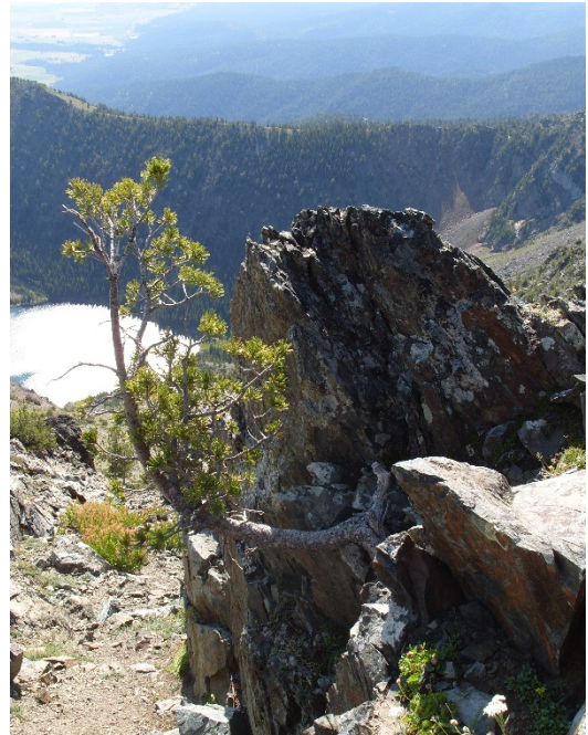
Figure 3. A small whitebark pine clings to a rock at the top of Elkhorn

Whitebark pine has a patchy distribution, with local populations existing on mountaintop “islands”, and replaced by other species at lower elevations (Cottone & Ettl 2001). Local populations are susceptible to extinction due to fires and outbreaks of mountain pine beetle ( Dendroctonus ponderosae ). Recolonization of populations, and any other movement between local populations, is due entirely to movement by an avian seed disperser, Clark’s nutcracker ( Nucifraga columbiana ) (Hutchins & Lanner 1982) (Fig. 4), which occasionally carries seeds sufficiently far to transport seeds between local populations on nearby peaks and to recolonize extinct populations (Lorenz et al. 2011).