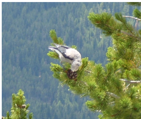
Figure 4. A Clark’s nutcracker pulls seeds out of a whitebark

Environmental variables: I am interested in the responses of vital rates to environmental variation, so I measured two environmental drivers that are relevant for whitebark pine: aggregation and elevation.